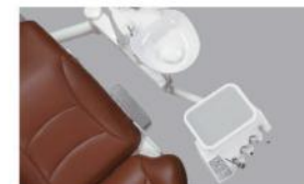
Four hands operation