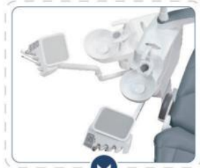
Rotatable in 45° side box