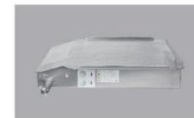
Liftable mobile trolley