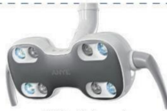
White light mode