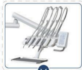
Hang Up The Tool Tray