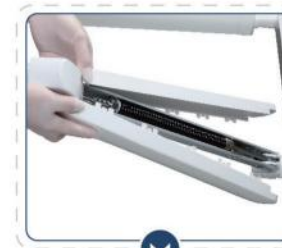
Cast aluminum light arm