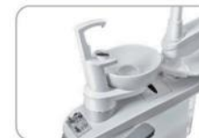
New type of spittoon