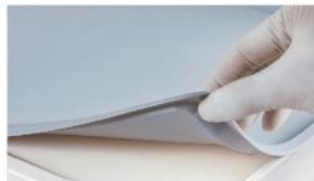
Instrument tray silicone pad