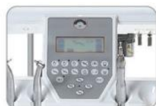
Multifunctional operation panel