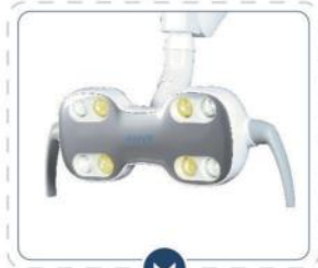
8 Beads LED operating light