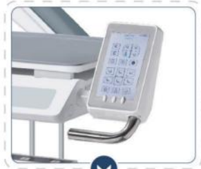
LCD touch screen control panel