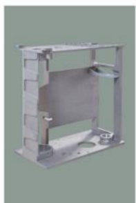
Cast aluminum cabinet frame