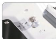
General switch (on/off) for water, air and electricity