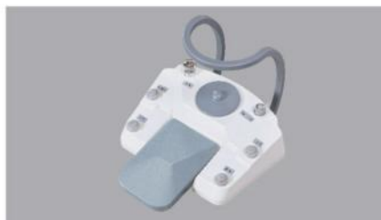
Cast aluminum multifunctional foot pedal