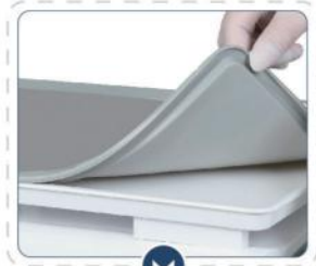
Silicone pad for instrument tray