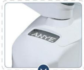
Side box logo lights