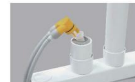
Saliva suction filter