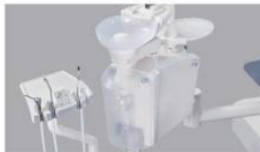
Rotatable side box