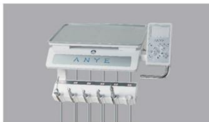
Anye Control System