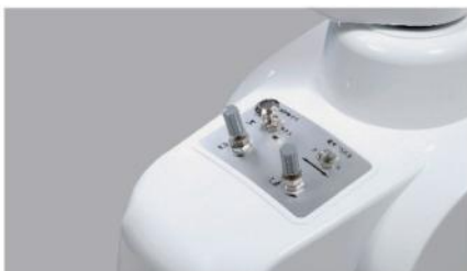
Water regulation of flushing and water supply