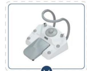
Cast aluminum multifunctional foot pedal