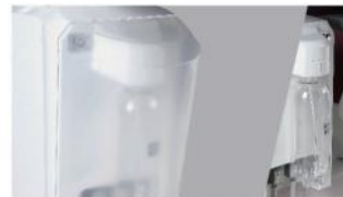
Hidden water bottle