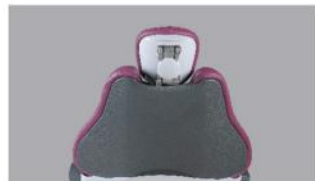
Strong chair backrest