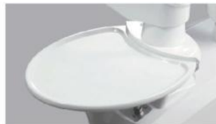
Plate for storage