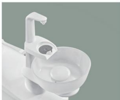
Detachable rotating spittoon

Reflecting a unique, intimate and clean design appearance, the clinic's bright warm colors create a simple modern atmosphere that is admired by dentist.