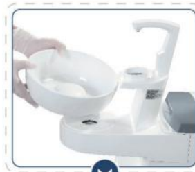
Detachable rotating spittoon