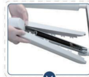
Cast Aluminum Light Arm