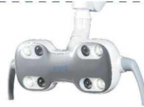
White light mode