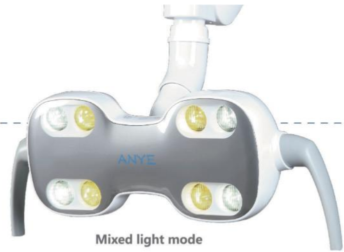
Mixed light mode