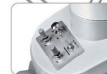
Water regulation of flushing and water supply