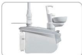
Standard configuration: Gray side box cover plate