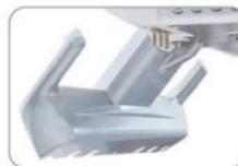
cast aluminum handpiece rack