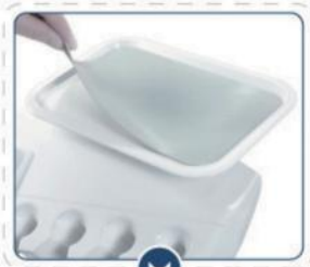
Assistant Tray Silicone Pad