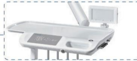
Large Instrument Tray