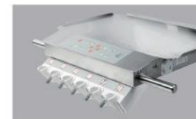
Six piece handpiece tubes

12 beads large aperture LED surgical implant light, infrared induction stepless dimming, good lighting effect, more uniform light.