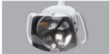
Reflected LED operating light (white/yellow light)