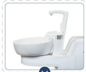
Concealed rotating spittoon