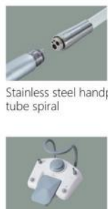
Stainless steel handpiece tube spiral