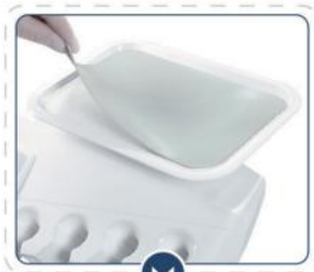
Assistant tray silicone pad