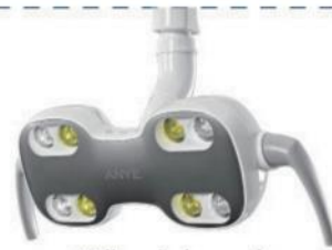
Yellow light mode