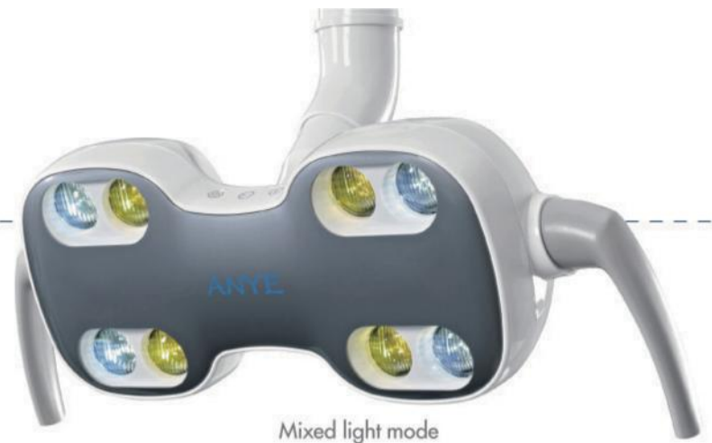
Mixed light mode