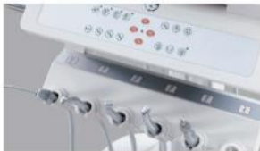
With nine memories and 6 piece handpiece tubes