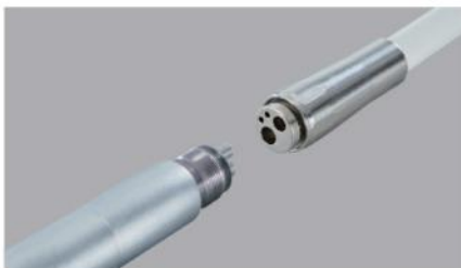
Stainless steel handpiece tube spiral