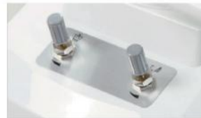
Water regulation of flushing and water supply