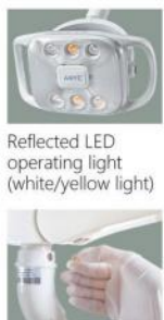
Reflected LED operating light (white/yellow light)