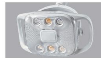
6 beads LED operating light