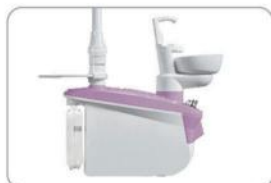
Optional: Purple side box cover

Selected materials Selected high-quality ASA casting materials, integrated molding casting process; High purity, produced using 100% pure ASA material.