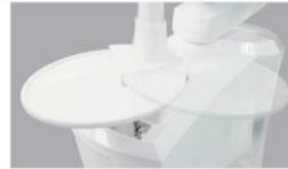
Plate for storage