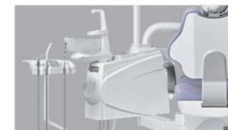
Rotatable in 45° cabinet