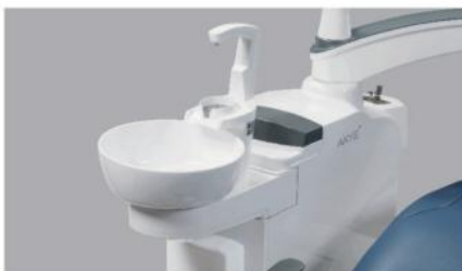
Removable rotating spittoon