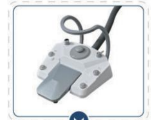
Cast Aluminum Multifunctional Foot Pedal