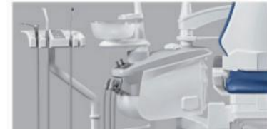
Rotatable in 45° side box