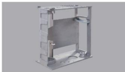
Cast aluminum cabinet frame