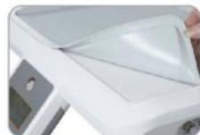
Instrument tray silicone pad