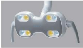
8 Beads Philips beads LED Operating light