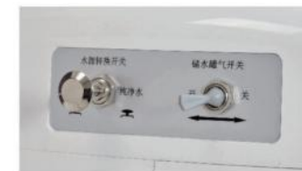
Water regulation of flushing and water supply