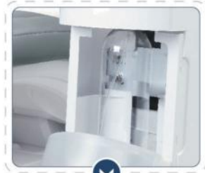
Hidden water bottle