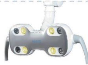
Yellow light mode