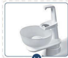
Detachable Rotating Spittoon