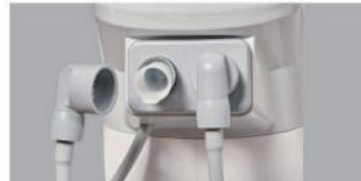
Saliva suction system